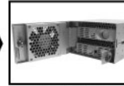
Fig.8a for CKDF

6. Inserting the carrier along with HDD into the body. Align the two sides of carrier with the anti-shock rails located at the left and right sides inside the body. (Fig.7a)