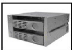
Fig.10b for CPF

9. Close the front door and insert the key into the lock hold to lock. Turning the key clockwise to complete HDD installation. (Fig.10a) (Fig.10b)