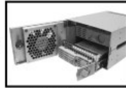
Fig.7a for CKDF

5. Secure the HDD to the carrier using the four 6#-32 screws provided. ( Fig.6)