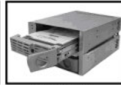
Fig.7b for CPF

6. Inserting the carrier along with HDD into the body. Align the two sides of carrier with the anti-shock rails located at the left and right sides inside the body. (Fig.7a)