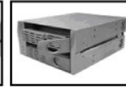
Fig.8a for CPF

7. Keep the handle angled from the carrier, then slide the carrier along the anti-shock rails and into the body until fully inserted. (Fig.8a) (Fig.8b)