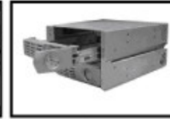
Fig.4b for CPF

3. Removing the HDD carrier away from the body. (Fig.4a) (Fig.4b)