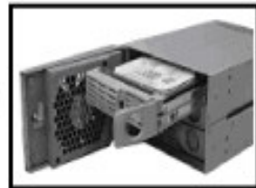
Fig.7a for CKDF

5. Secure the HDD to the carrier using the four 6#-32 screws provided. ( Fig.6)