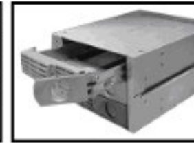
Fig.4b for CPF

3. Removing the HDD carrier away from the body. (Fig.4a) (Fig.4b)