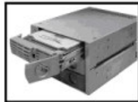
Fig.7b for CPF

6. Inserting the carrier along with HDD into the body. Align the two sides of carrier with the anti-shock rails located at the left and right sides inside the body. (Fig.7a)