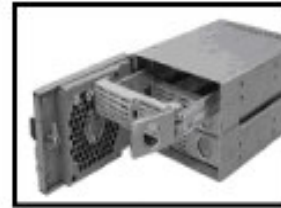
Fig.4a for CKDF

2. Use the miniature key and insert into the key hole to eject handle. (Fig.3)