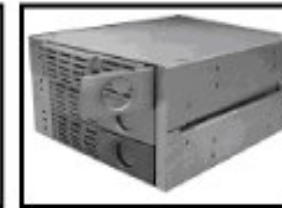
Fig.8a for CPF

7. Keep the handle angled from the carrier, then slide the carrier along the anti-shock rails and into the body until fully inserted. (Fig.8a) (Fig.8b)