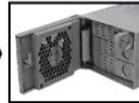
Fig.8a for CKDF

6. Inserting the carrier along with HDD into the body. Align the two sides of carrier with the anti-shock rails located at the left and right sides inside the body. (Fig.7a)