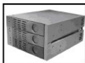
Fig.10b for CPF

9. Close the front door and insert the key into the lock hold to lock. Turning the key clockwise to complete HDD installation. (Fig.10a) (Fig.10b)