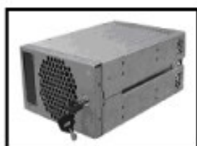
Fig.10a for CKDF

8. Push the handle towards the carrier until it click to completely secure the position of carrier. (Fig.9)