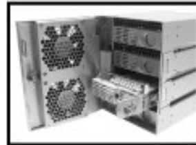
Fig.7a for CKDF

5. Secure the HDD to the carrier using the four 6#-32 screws provided. ( Fig.6)