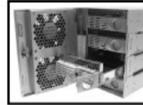
Fig.4a for CKDF

2. Use the miniature key and insert into the key hole to eject handle. (Fig.3)