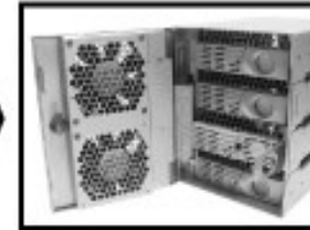
Fig.8a for CKDF

6. Inserting the carrier along with HDD into the body. Align the two sides of carrier with the anti-shock rails located at the left and right sides inside the body. (Fig.7a)