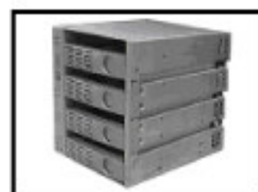
Fig.10b for CPF

9. Close the front door and insert the key into the lock hold to lock. Turning the key clockwise to complete HDD installation. (Fig.10a) (Fig.10b)