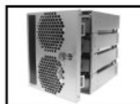
Fig.10a for CKDF

8. Push the handle towards the carrier until it click to completely secure the position of carrier. (Fig.9)