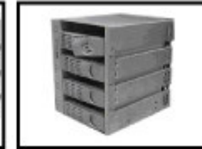
Fig.8a for CPF

7. Keep the handle angled from the carrier, then slide the carrier along the anti-shock rails and into the body until fully inserted. (Fig.8a) (Fig.8b)