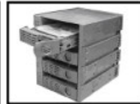
Fig.7b for CPF

6. Inserting the carrier along with HDD into the body. Align the two sides of carrier with the anti-shock rails located at the left and right sides inside the body. (Fig.7a)