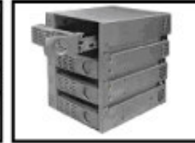
Fig.4b for CPF

3. Removing the HDD carrier away from the body. (Fig.4a) (Fig.4b)